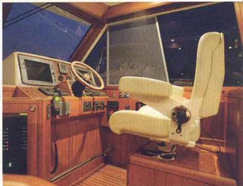
WEATHER REPORT: A fully enclosed salon offers protection from the elements (left); excellent visibility from the helm (above); and snug comfort in the master stateroom with a queen-sized berth (below, left).