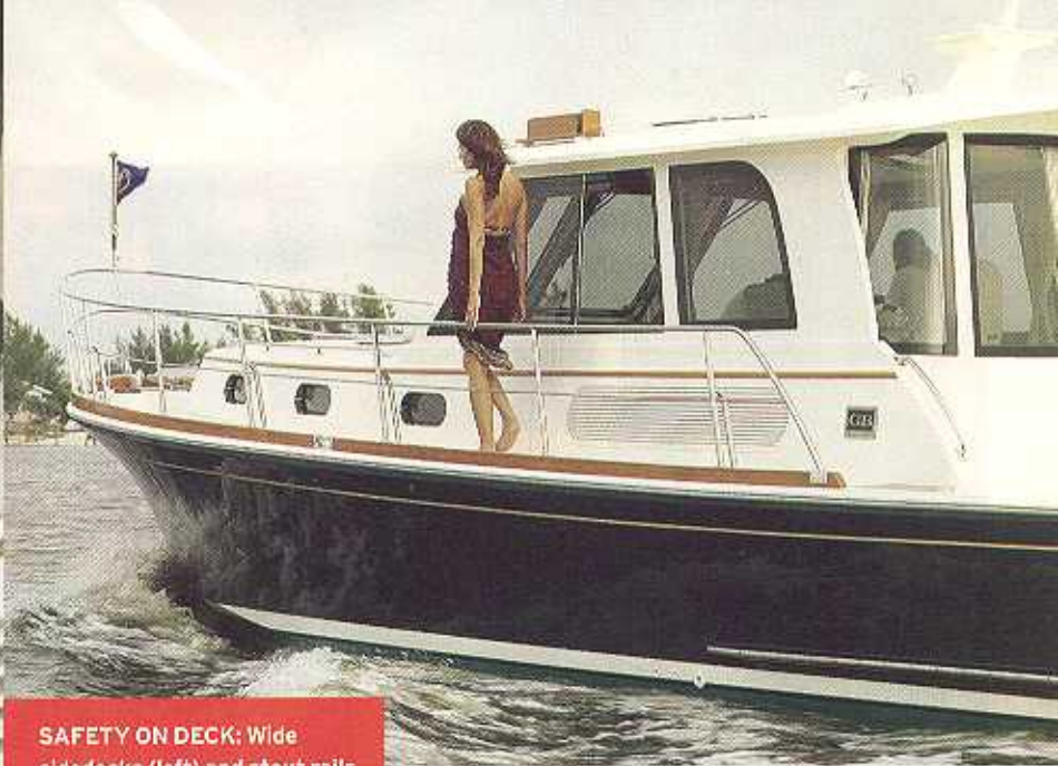
SAFETY ON DECK: Wide side decks (left) and stout rails (right) make docking easier.

conditions with aplomb, I expect the 39 Eastbay SX to be nothing short of brilliant when wind and waves build.