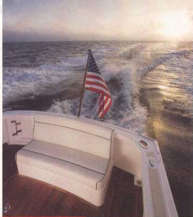
PLACE TO PAUSE: Bench seats in the cockpit (top) and salon (below) are relaxing.

Twin Yanmar 6LY3 diesel inboards on hull number one, the boat I tested, spooled out continuous power with no flat spots in the acceleration curve. Hard-over turns at high cruising speeds produced no untoward lean and minimal loss of speed. On the day of my test drive, the well-flared bow had no more trouble deflecting the spray from the one-foot waves marching in toward Sanibel Island from the Gulf of Mexico than it did the wakes we criss-crossed. Given the care which C. Raymond Hunt Associates takes to achieve a